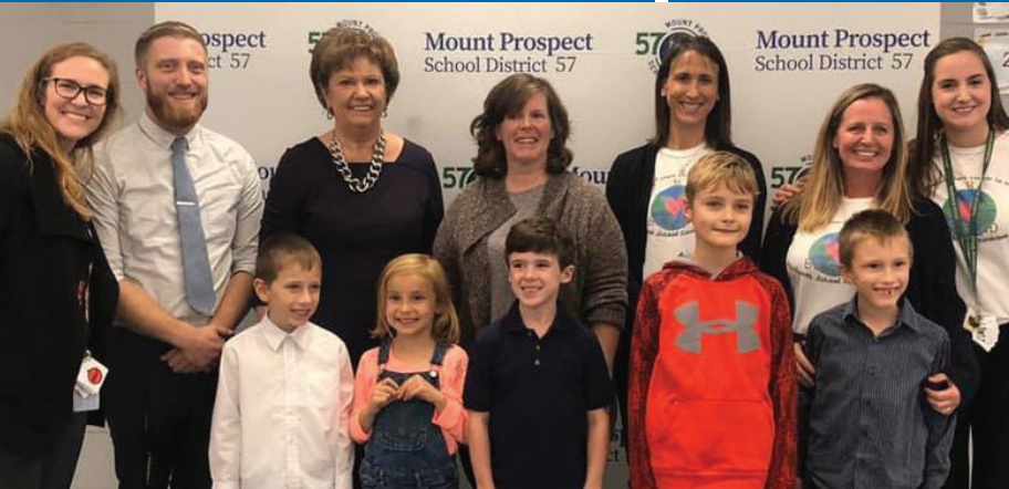
Honoring Westbrook's Kindness Club at a School Board meeting.