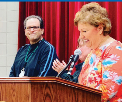
Paying tribute to staff at the Retirement and Recognition Breakfast.