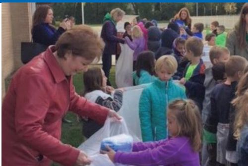
Working with students to sort items for a drive benefitting hurricane victims in Puerto Rico.