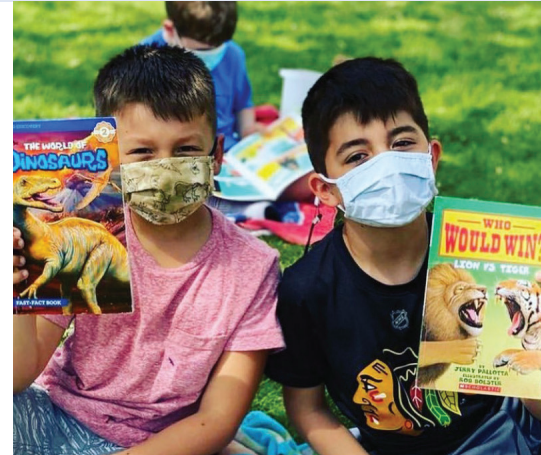
Students sit outside at Westbrook and read their favorite LRC books on blankets on a beautiful spring day.